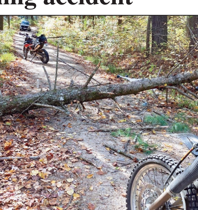
This pine tree fell across West Wolf Creek Road Saturday, killing a local motorcyclist who was riding through the

deceased at the scene." West Wolf Creek is a single-lane road that runs through the Chattahoochee National Forest near Vogel State Park.