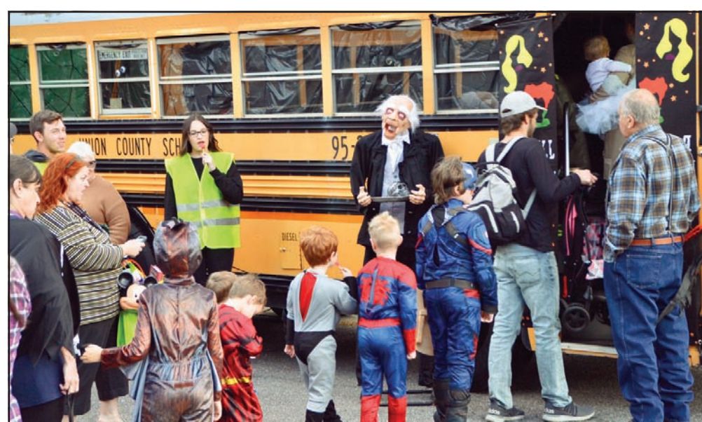
The School Transportation Department put together a "Spooky, Scary Bus Tour" to the delight of children attending Trunk or Treat on Saturday.

duck races, live music all day, blind eating and judging to campground trick-or-treating award for best ribs, brisket, from 5-6:30 p.m., campsite sides and dessert, with live See Halloween '22, Page 6A