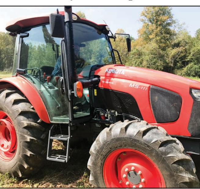
Kubota M5-111 from Nelson's Tractor

The Georgia Mountain Research and Education Center invites you to a Tractor Safety Workshop on November 4th from 9 AM to 4 PM. Whether a hobbyist or a fulltime farmer, it is crucial to understand how to operate a tractor and implements safely.